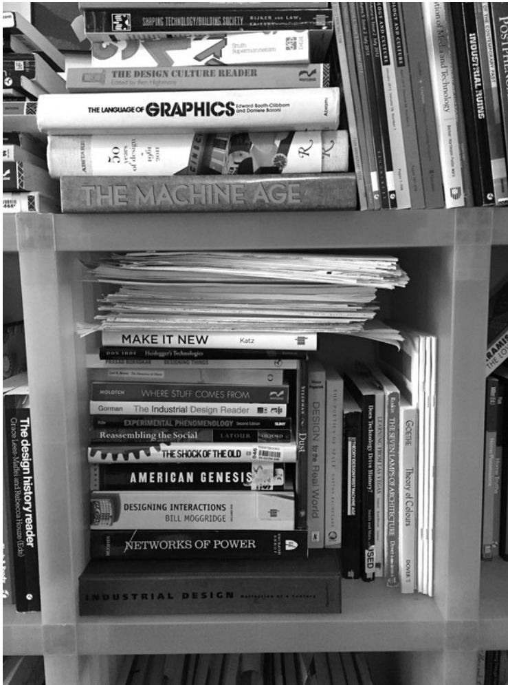
Figure 1. One of the author's bookshelves.

I offer my final sections in the form of four statements that begin to explain what design history can bring to the historical study of games. Such statements ought to be read as conceptive observations that I feel are warranted even at this early stage of my project, when crucial archival documents are filed but are still being actively interpreted. In fact it is very fair to say that