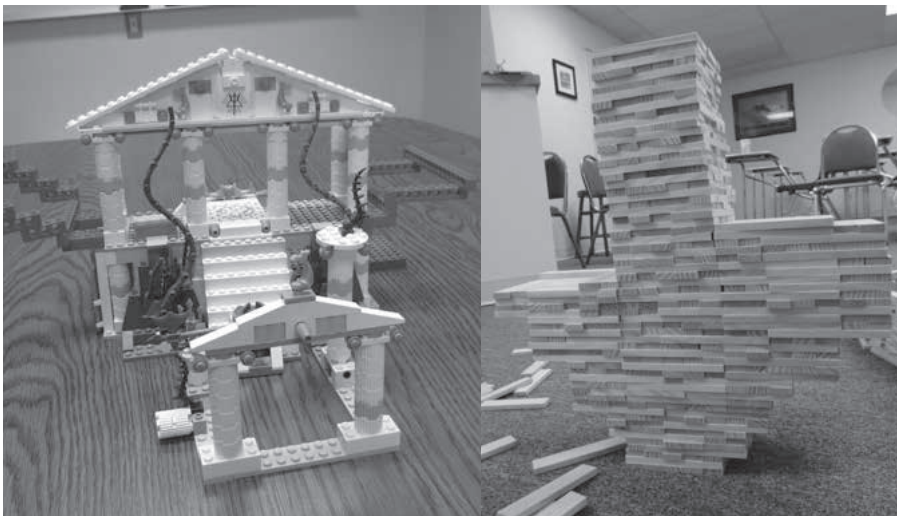
Figure 3. A comparison of cantilever constructions when considering bricks (left) and planks (right).

As we have discussed, an empirical abstraction necessitates the physical manipulation of an object to recognize its potential uses based on physical properties. A reflective abstraction is based on prior experience learned from the empirical abstraction and is the conceptual understanding based on the object's properties. The reflective abstraction involves knowing the outcome of manipulating an object without having to do so physically. An essential question to consider, then, is how the affordances of VCPOs may affect the gradual transition from empirical abstractions to reflective ones. To answer this question, it is important to examine the basic concept of balance by comparing a construction using planks to one using bricks. The design of a structure that requires